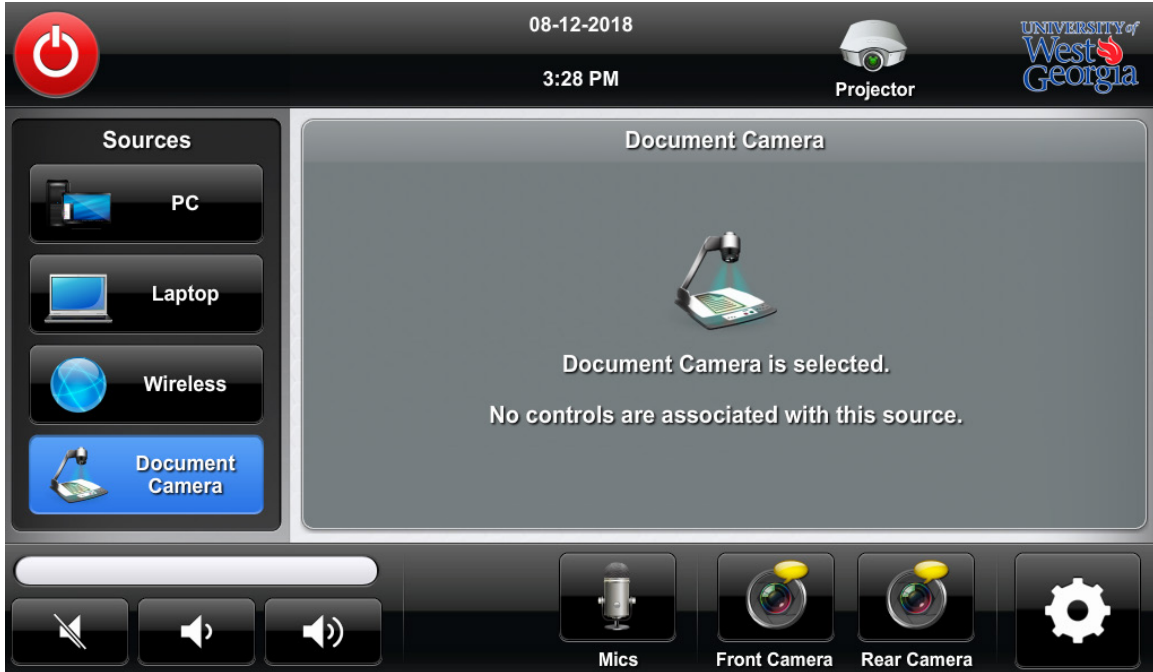
Document Camera Page

Control the lectern and wireless mic from this page.